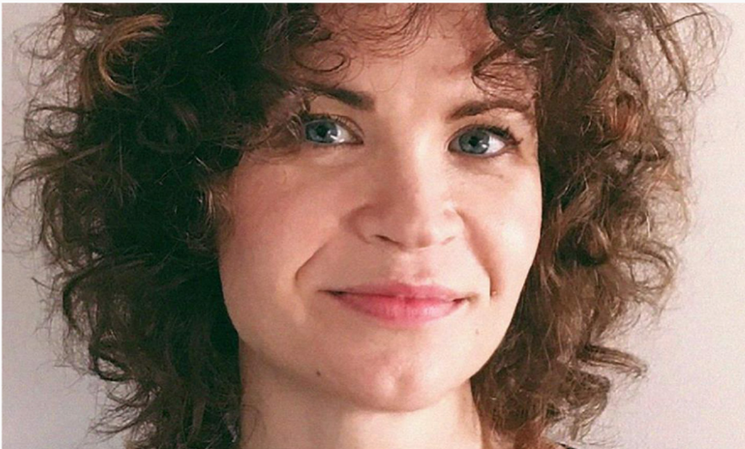
Director Dalila Droege will be showing her feature film at DCA's Dundead Film Festival.

LA-based filmmaker Dalila made pandemic movie No More Time during the real-life Covid-19 lockdowns.